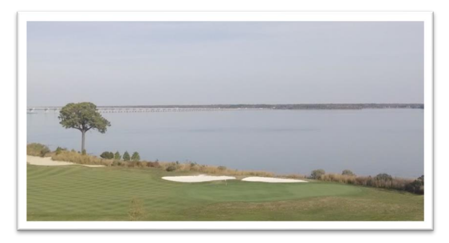
A 2013 Women's Retreat